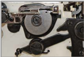
Differential feed ratio adjustment